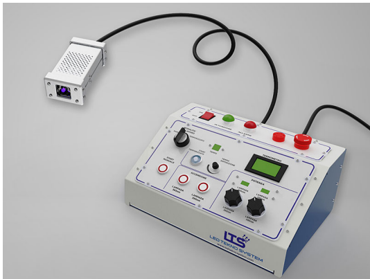
uv led lamp for industry